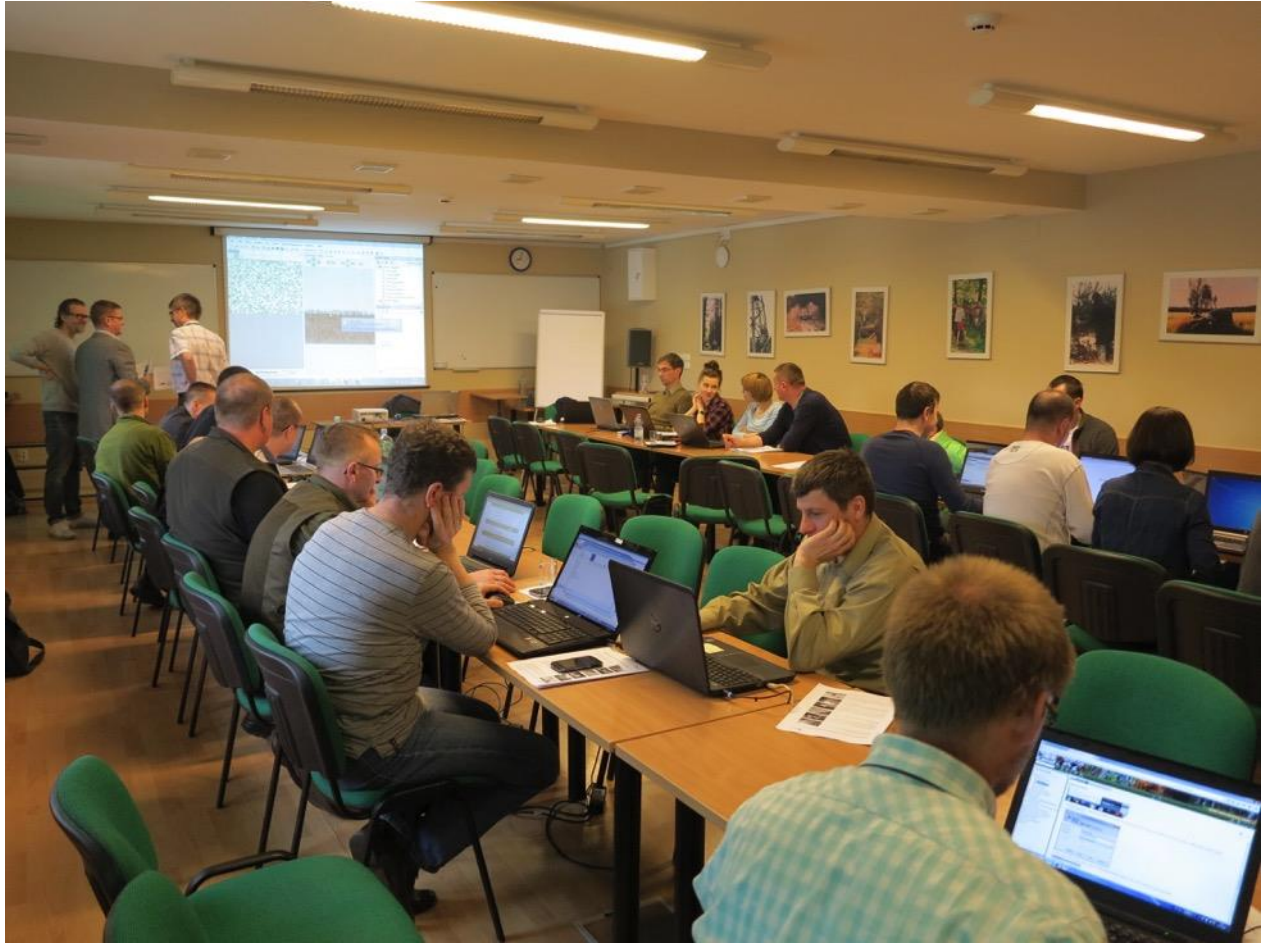
Fig. 9. Practical activities in one of the computer rooms.