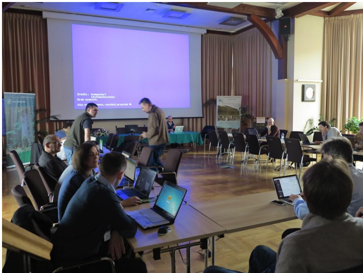
Fig. 10. Practical activities in one of the computer rooms.